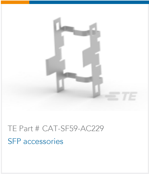
TE Part # CAT-SF59-AC229 SFP accessories