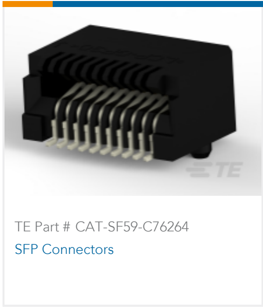
TE Part # CAT-SF59-C76264 SFP Connectors