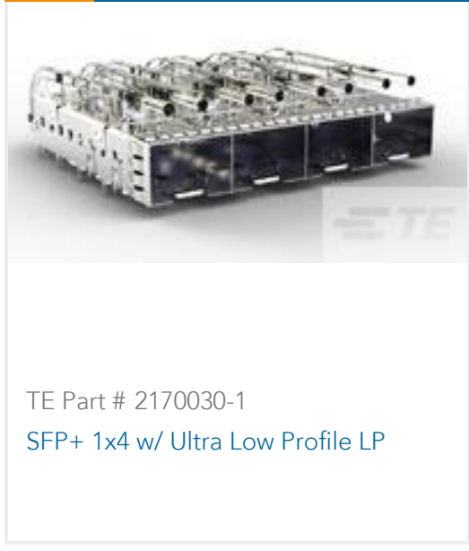
TE Part # 2170030-1 SFP+ 1x4 w/ Ultra Low Profile LP