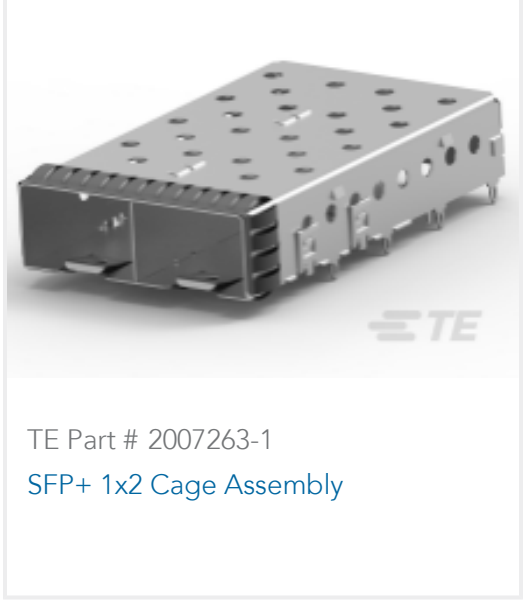
TE Part # 2007263-1 SFP+ 1x2 Cage Assembly