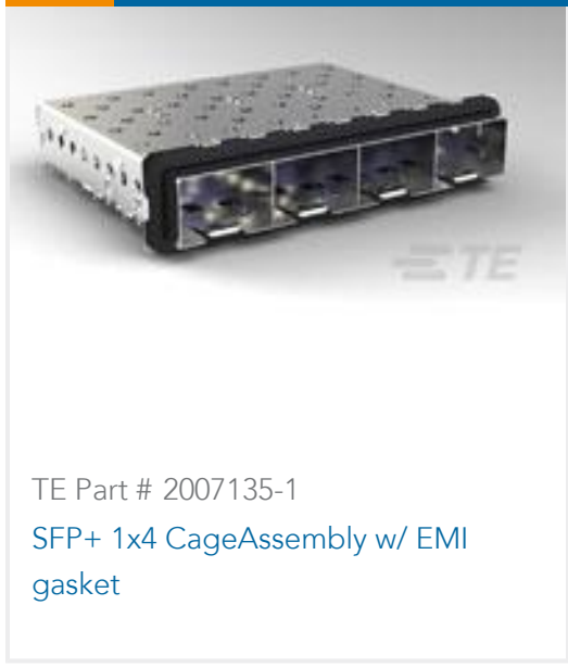
TE Part # 2007135-1 SFP+ 1x4 Cage Assembly w/ EMI gasket