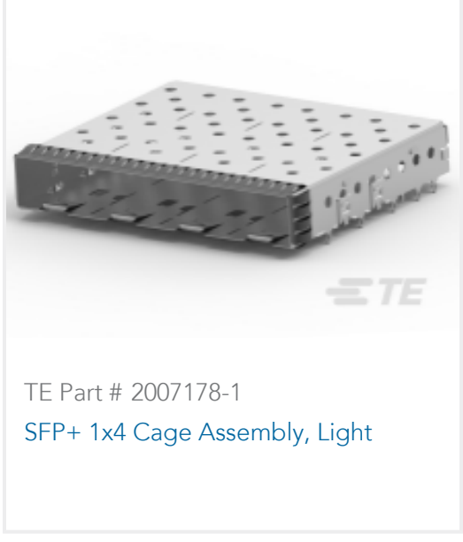
TE Part # 2007178-1 SFP+ 1x4 Cage Assembly, Light