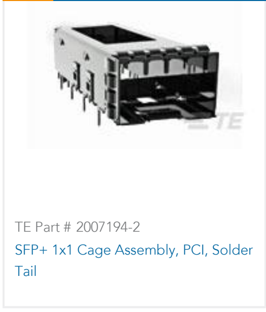
TE Part # 2007194-2 SFP+ 1x1 Cage Assembly, PCI, Solder Tail