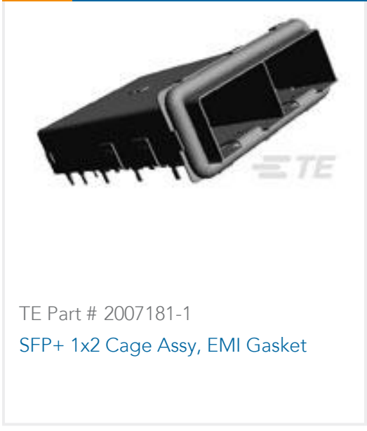
TE Part # 2007181-1 SFP+ 1x2 Cage Assy, EMI Gasket Tail