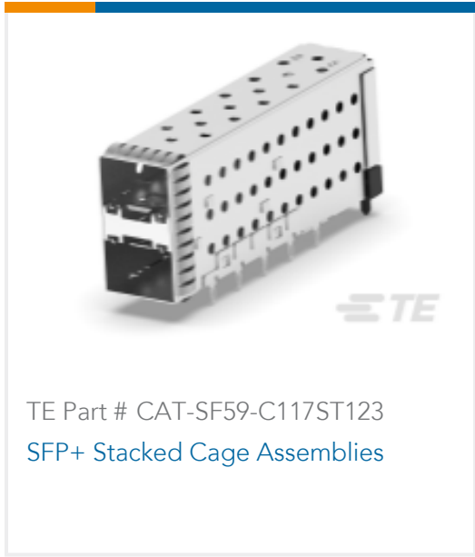
TE Part # CAT-SF59-C117ST123 SFP+ Stacked Cage Assemblies