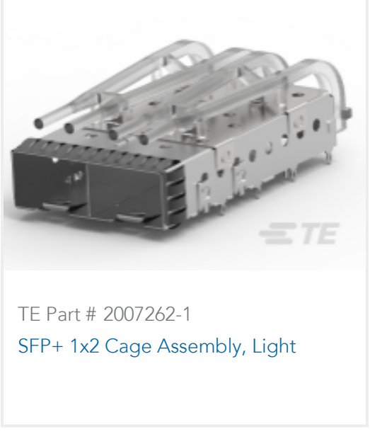
TE Part # 2007262-1 SFP+ 1x2 Cage Assembly, Light