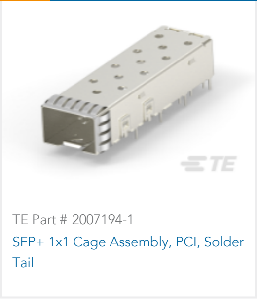
TE Part # 2007194-1 SFP+ 1x1 Cage Assembly, PCI, Solder Tail