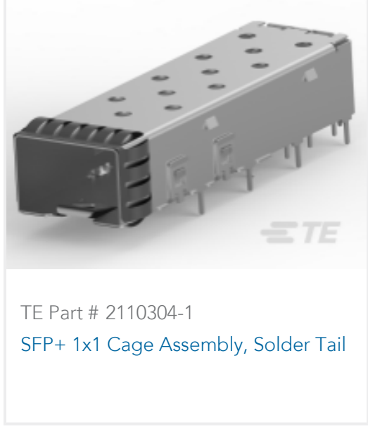
TE Part # 2110304-1 SFP+ 1x1 Cage Assembly, Solder Tail