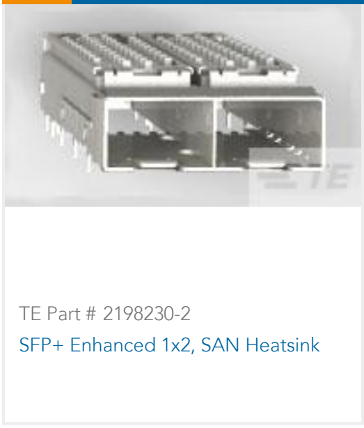
TE Part # 2198230-2 SFP+ Enhanced 1x2, SAN Heatsink