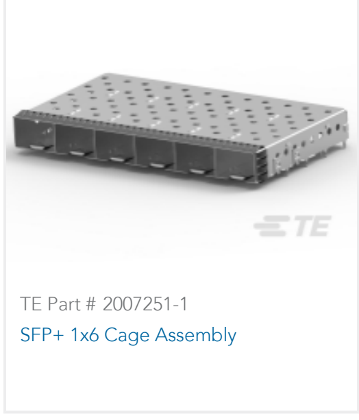
TE Part # 2007251-1 SFP+ 1x6 Cage Assembly