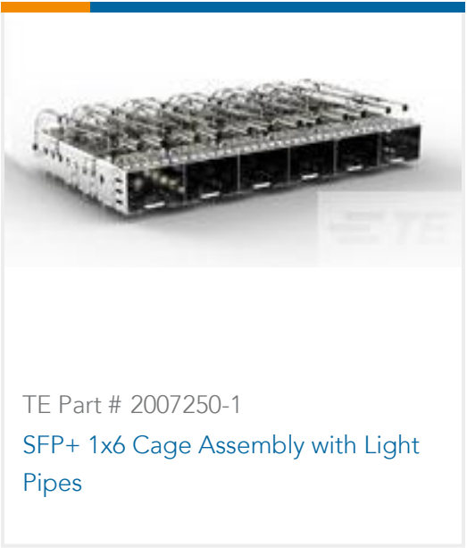
TE Part # 2007250-1 SFP+ 1x6 Cage Assembly with Light Pipes