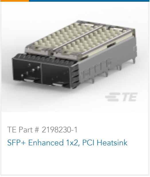
TE Part # 2198230-1 SFP+ Enhanced 1x2, PCI Heatsink