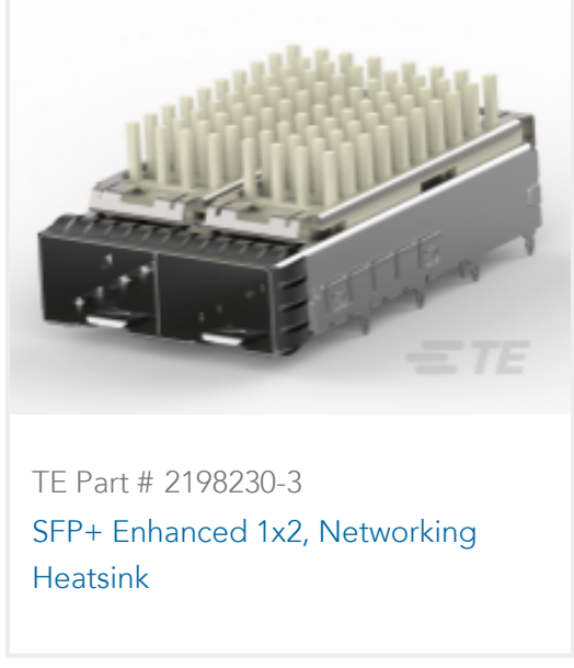
TE Part # 2198230-3 SFP+ Enhanced 1x2, Networking Heatsink