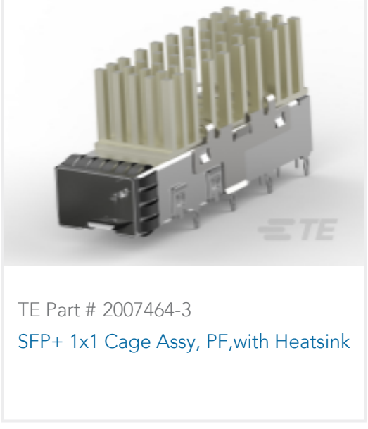
TE Part # 2007464-3 SFP+ 1x1 Cage Assy, PF, with Heatsink