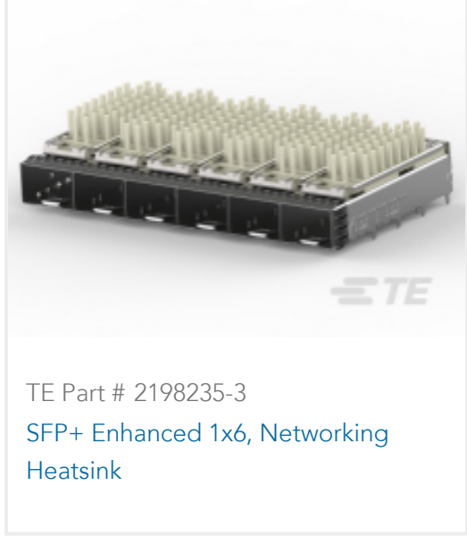
TE Part # 2198235-3 SFP+ Enhanced 1x6, Networking Heatsink